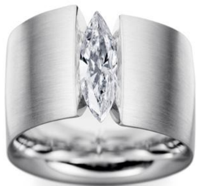
RING | REF. CALBR (WHITE MARQUISE CUT)