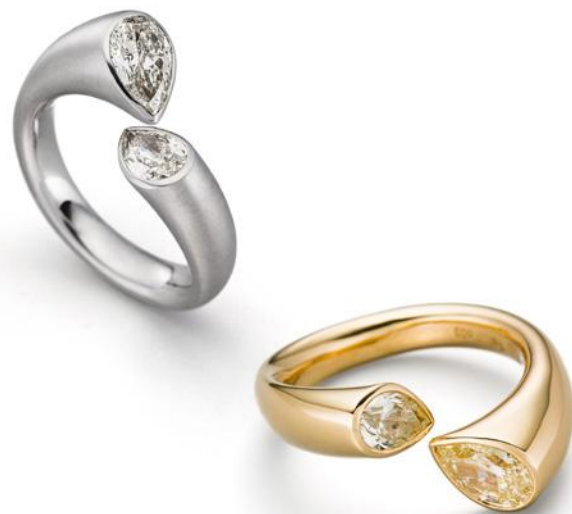
RINGS | REF. CALTR (PEAR SHAPE CUT)