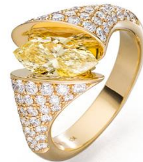
RING | REF. CALFP (YELLOW MARQUISE CUT)