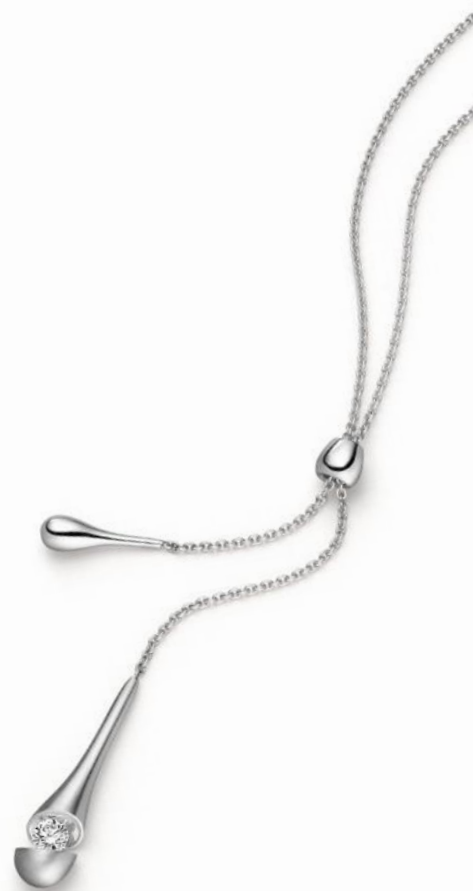
NECKLACES | REF. CALD1