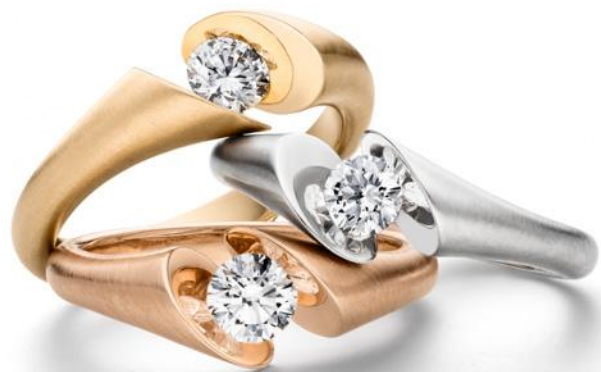
RINGS | REF. CALLA (0,40/0,30/0,50CT)