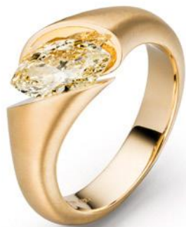
RING | REF. CALLF (YELLOW MARQUISE CUT)