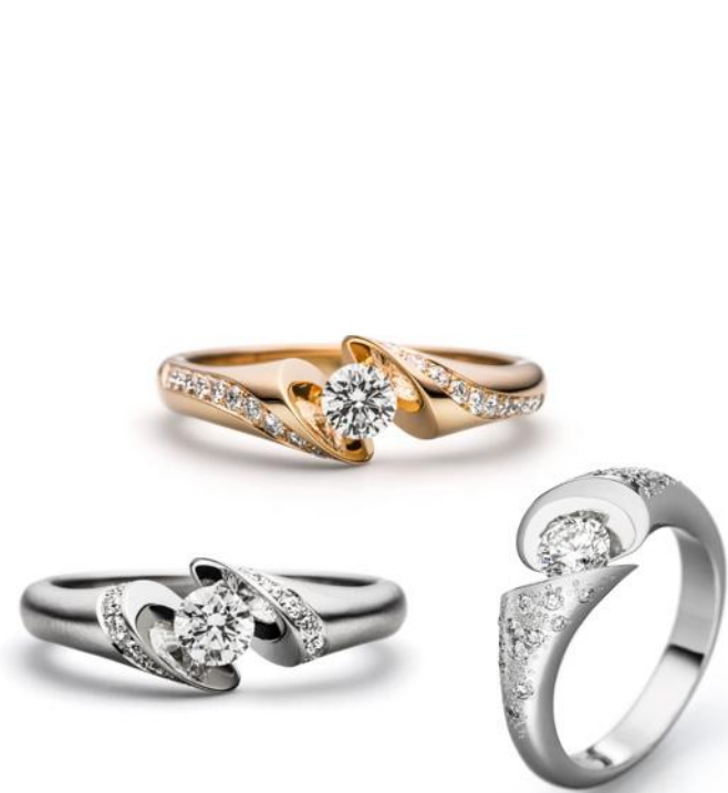
RINGS | REF. CALLX, CALLZ AND CALLW