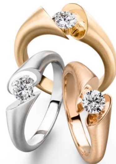
RINGS | REF. CALLA (0,30/0,40/0,50CT)