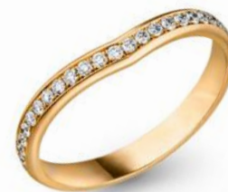
RINGS | REF. C24T1