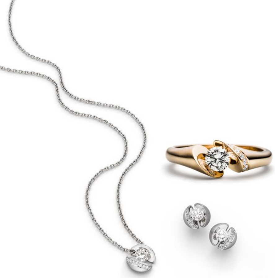
RING, NEACKLACE AND EARRINGS | REF. CALLY