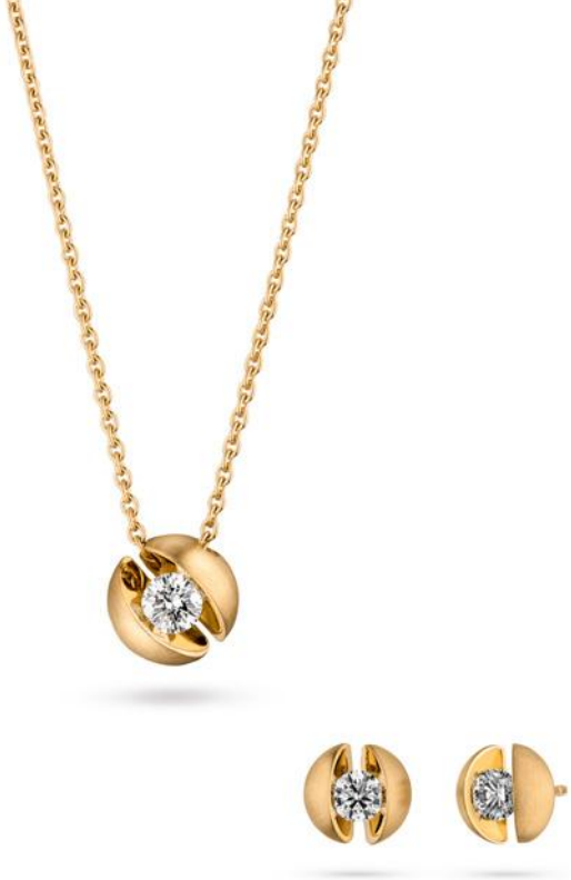
NECKLACE AND EARRINGS | REF. CALL2