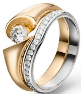
RING + MATCHING BAND | REF. CALLA AND C24T1