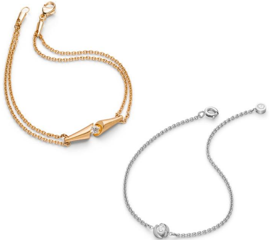
BRACELETS | REF. CALAB AND CALL2