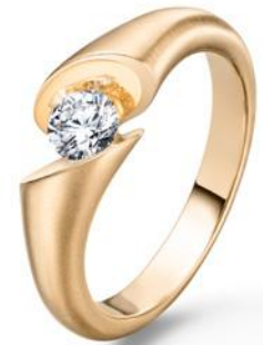
RING | REF. CALLA