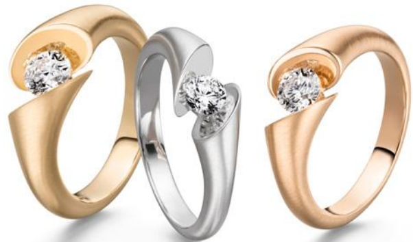
RINGS | REF. CALLA (0,40/0,30/0,50CT)