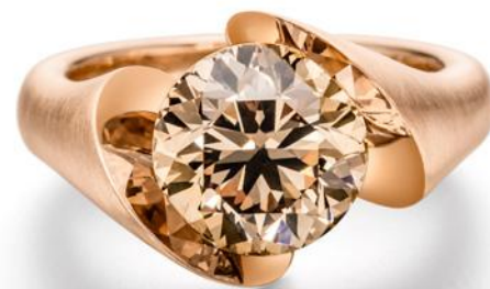
RING | REF. CALLA (3,00CT CHAMPAGNE)