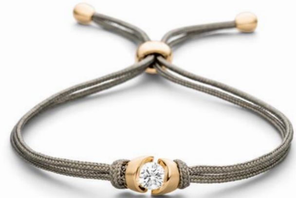
BRACELET | REF. CT001 (0,40CT)