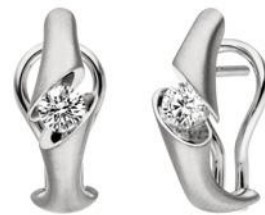
EARRINGS WITH CLIP | REF. CALOC