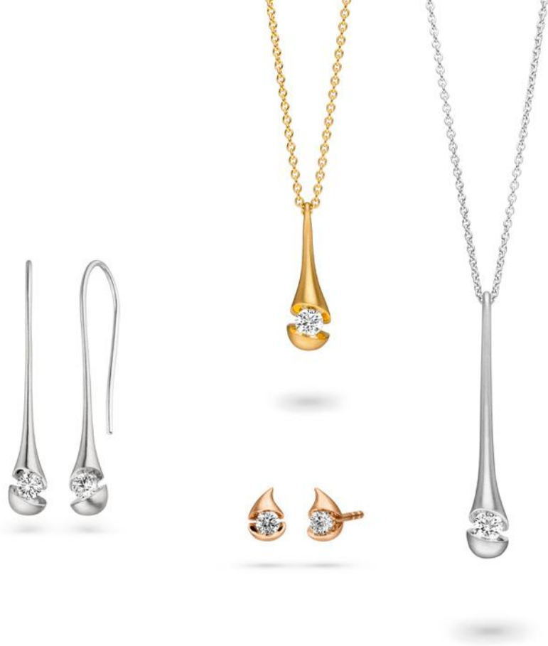
HANGERS, EARRINGS AND NECKLACES | REF. CALDR, CALD7, CALD3 AND CALD2