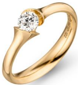
EARRINGS, NECKALCE AND RING | REF. CALSO