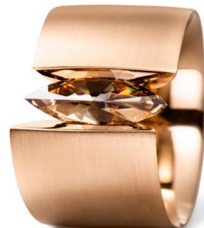
RING | REF. CALBR (CHAMPAGNE MARQUISE CUT)