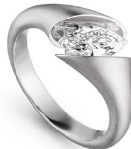
RINGS | REF. CALLF (WITH DIFFERENT COLOURS AND CUTS)