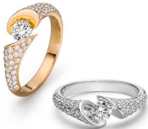
RINGS | REF. CALLP