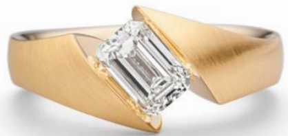
RING | REF. CALEM (EMERALD CUT)