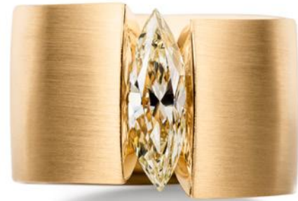
RING | REF. CALBR (YELLOW MARQUISE CUT)